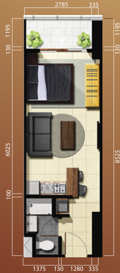
suite B Semi Gross 34.5