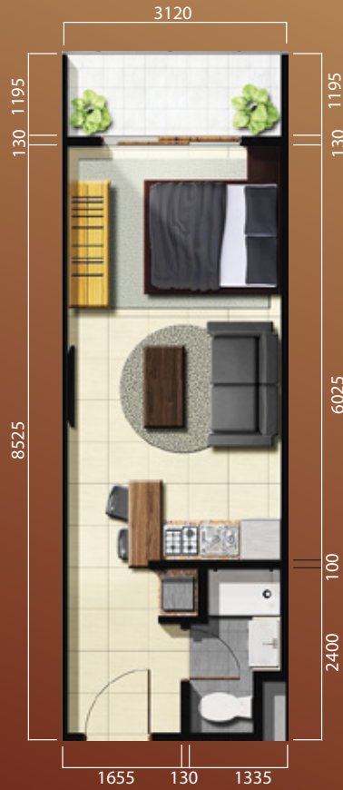
suite A Semi Gross 36.1