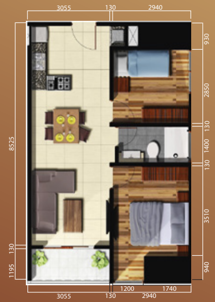
2 BEDROOM C Semi Gross 66