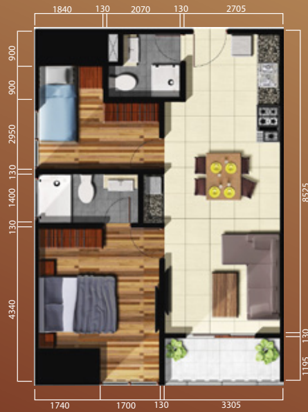
2 BEDROOM B Semi Gross 74.7