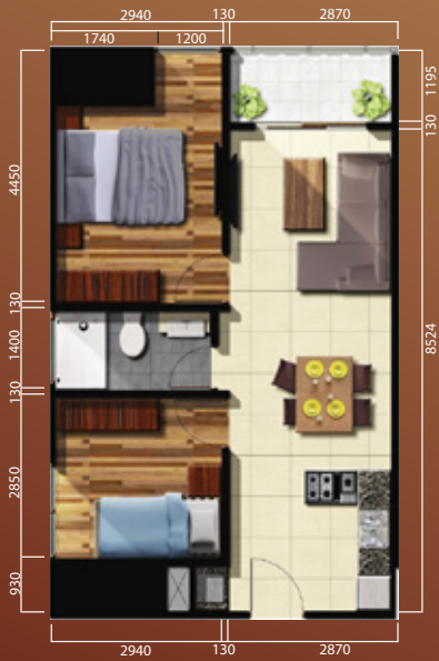
2 BEDROOM A Semi Gross 63.8